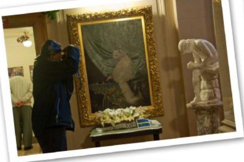
FROM: PITTOCK MANSION DECEMBER 2011

SORRY YOU MISSED CHRISTMAS AROUND THE WORLD. WE ENJOYED THE CHRISTMAS TREES & HOLIDAY DÉCOR FROM ANTARCTICA, GREAT PRITAIN, ITALY & BEYOND. THERE WERE PENGUINS IN THE INSULATED REFRIGERATOR ROOM! THE TREE OF CRANES (SEE ORIGAMI PHOTO) DECORATED ONE OF THE SMALLER BEDROOMS. WEATHER WAS BRISK, SO WE QUICKLY HEADED OUT FOR SOME FRESH AIR. PASTA FOR LUNCH. PRO PHOTO JUST DOWN THE WAY WAS TOO GOOD TO PASS UP FOR THE DEDICATED GEAR HEADS!